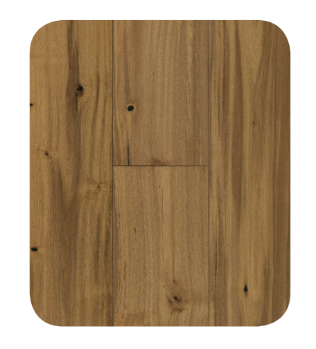
Abella Lively SKU Number: AB127LI