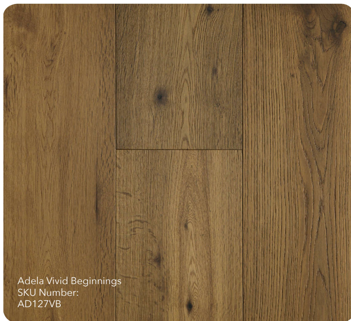
Adela Vivid Beginnings SKU Number: AD127VB