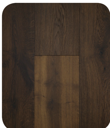
Adela Natures Way SKU Number: AD127NW