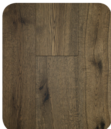
Adela Clear Presence SKU Number: AD127CP