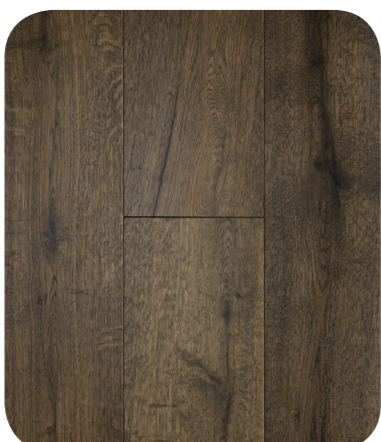
Adela Perfect Palette SKU Number: AD127PP