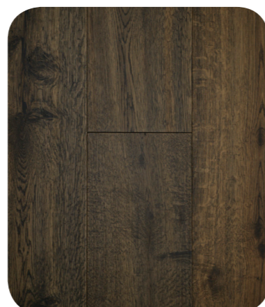
Adela Overtures SKU Number: AD127OV