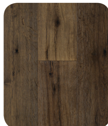
Adela Rich Request SKU Number: AD127RR