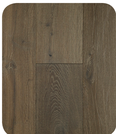
Amara Compelling SKU Number: AM127CP