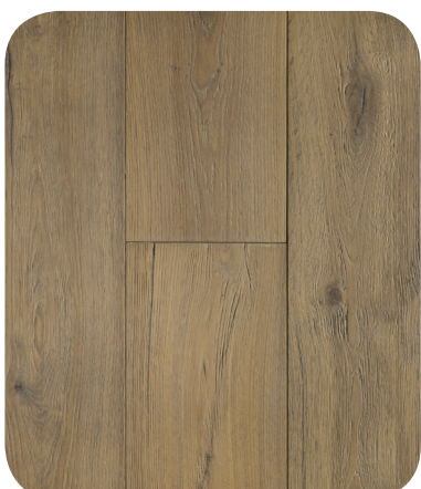
Amara Perfect Play SKU Number: AM127PP