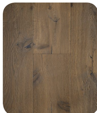
Amara Life Inspired SKU Number: AM127LI