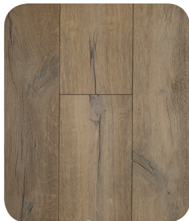
Anew Recaptured SKU Number: AW127RC