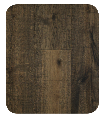
Anton Praise Worthy SKU Number: AN127PW