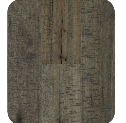
Anton Ambiance SKU Number: AN127AM