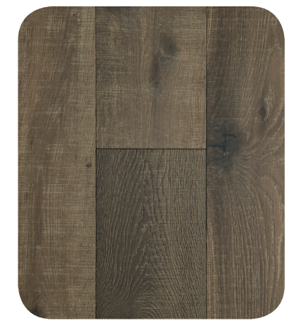
Anton Charmed SKU Number: AN127CH