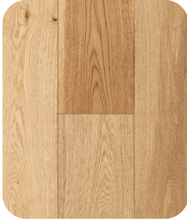
Bliss Moonlit SKU Number: BL127ML