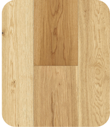
Bliss Summer Love SKU Number: BL127SL