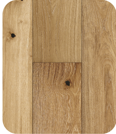
Bliss New Dawn SKU Number: BL127ND

ZERO·ADD® zero added formaldehyde. better air quality.