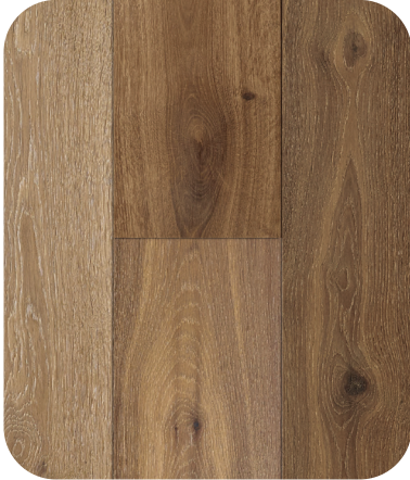
Bliss Light House SKU Number: BL127LH