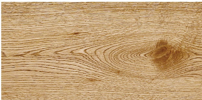
VIBRANT SKU# H2CS147VI