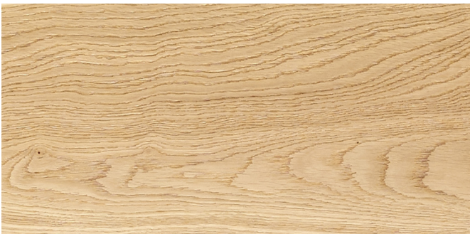
SERENITY2 SKU# H2CS147SE