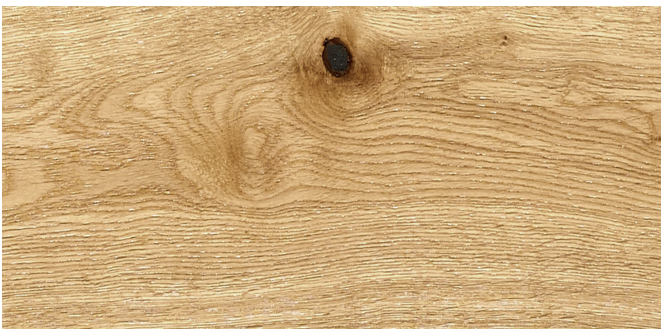
RELAXED SKU# H2CS147RE