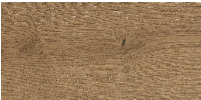
ESCAPE SKU# H2CS147ES