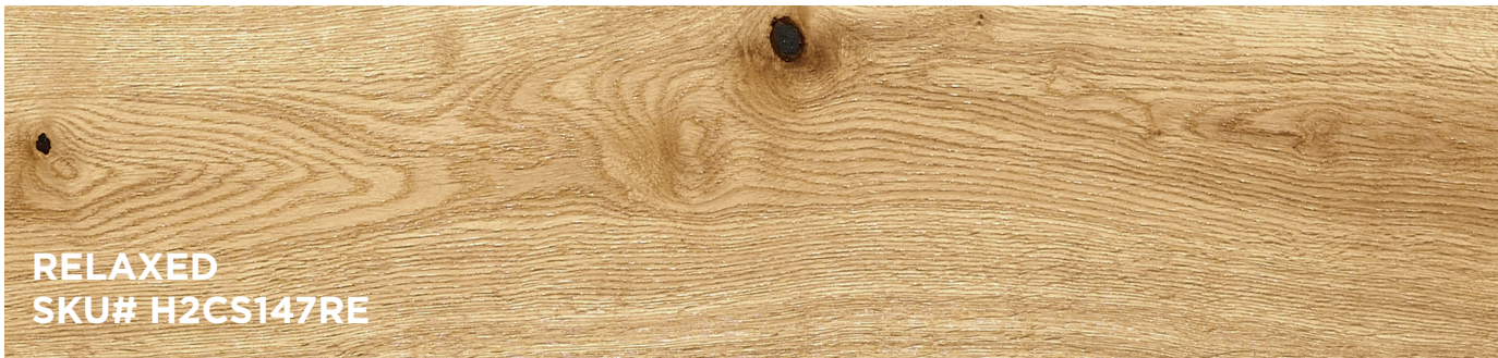
RELAXED SKU# H2CS147RE