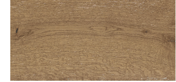
ESCAPE SKU# H2CS147ES