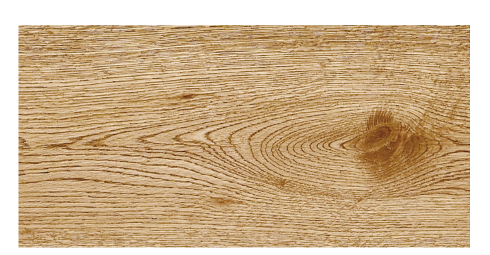
VIBRANT SKU# H2CS147VI