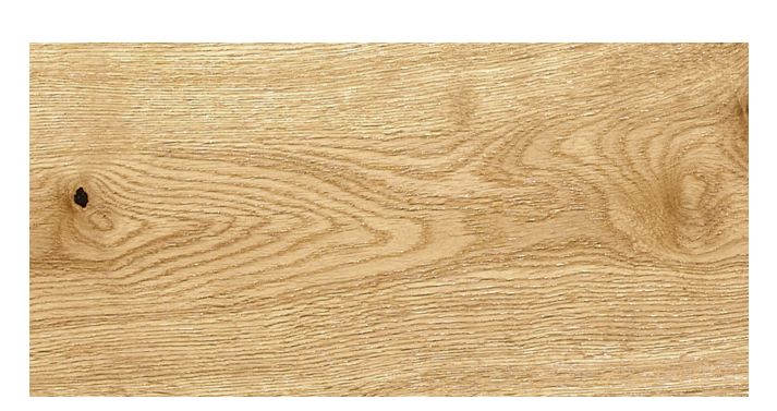
RELAXED SKU# H2CS147RE