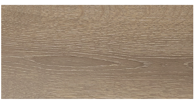
MANOR HOUSE SKU# H2FF147MH