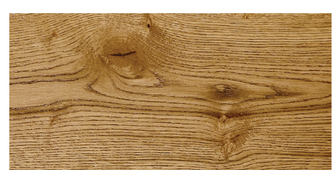
RESTFUL RIPPLE SKU# H2UO147RR