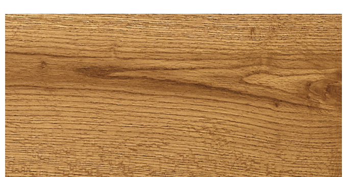
REACTIVE WAVE SKU# H2UO147RW