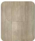
Abella Artful SKU Number: AB127AR