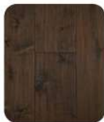
Abella Moderna SKU Number: AB127MO