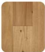
Abella Southern Breeze SKU Number: AB127SB