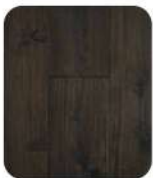
Abella Artisan SKU Number: AB127AA