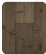
Abella Narratives SKU Number: AB127NA